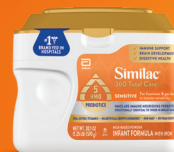
Similac® 360 Total Care® Sensitive**†‡