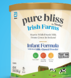
Pure Bliss® by Similac Irish Farms**†‡