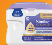
Similac Pro-Total Comfort**†‡