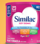
Similac® Soy Isomil®